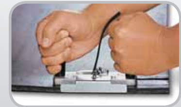
Flexco® Belt Groover