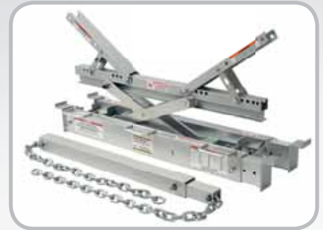
Flex-Lifter™ Belt Lifter