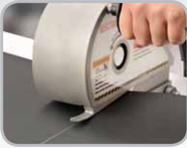
Electric Belt Cutter