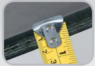
Measure belt thickness.