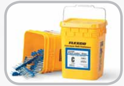
Conveniently packed, easy-to-use