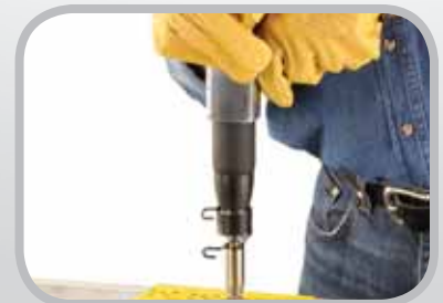
Air Powered Rivet Driver Installation