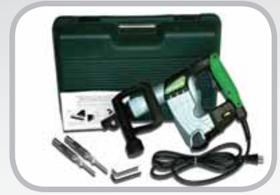
Electric Powered Rivet Driver

*Kit includes Driver, two Custom Drive Rods, Convenient Carrying Case