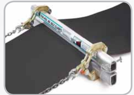
Far-Pul® HD® Belt Clamp