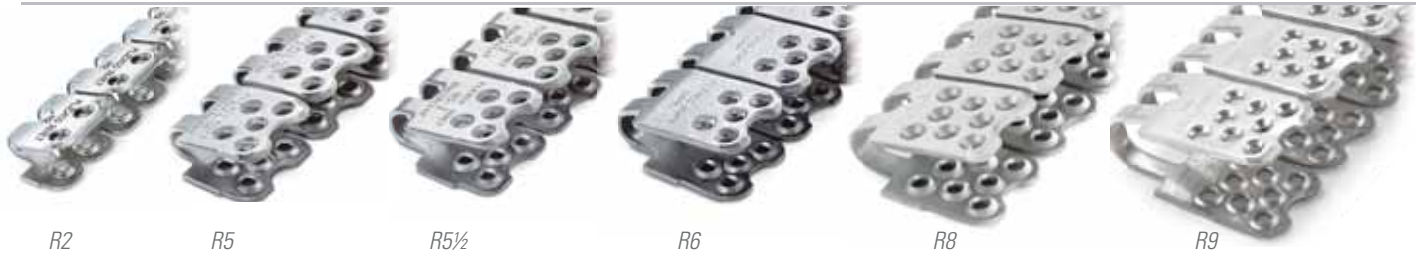
Flexco® Rivet Hinged Fastener Selection Chart

Use the charts below to match the Flexco® SR™ fastener to your needs. Find the fastener metal type required for your application. Then choose the ordering number that corresponds to your belt's width from the charts on the following pages.