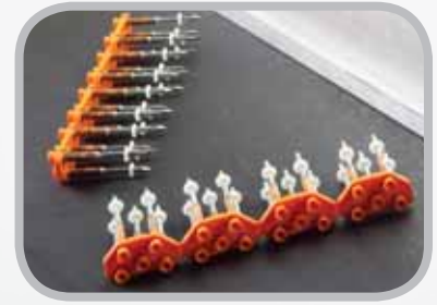
Rapid Loader™ Collated Rivet Strips with washers