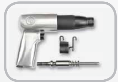
Air Powered Rivet Driver