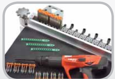
Select installation method.