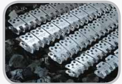
Select fastener size.