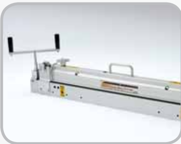
900 Series* Belt Cutter