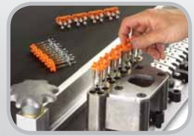
Speed Installation Time