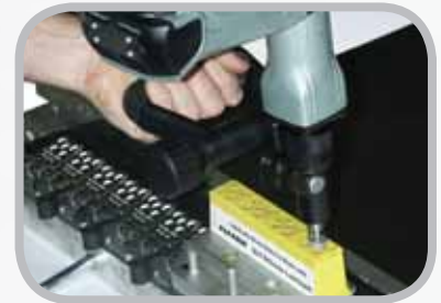
Electric Powered Rivet Driver Installation