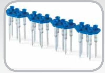
Rapid Loader™ Collated Rivet Strips