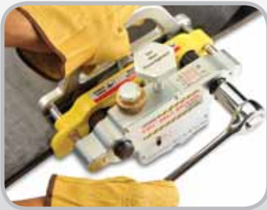
FSK™ Belt Skiver